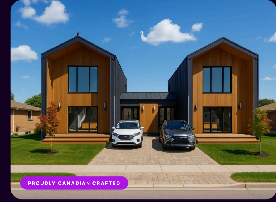
PROUDLY CANADIAN CRAFTED